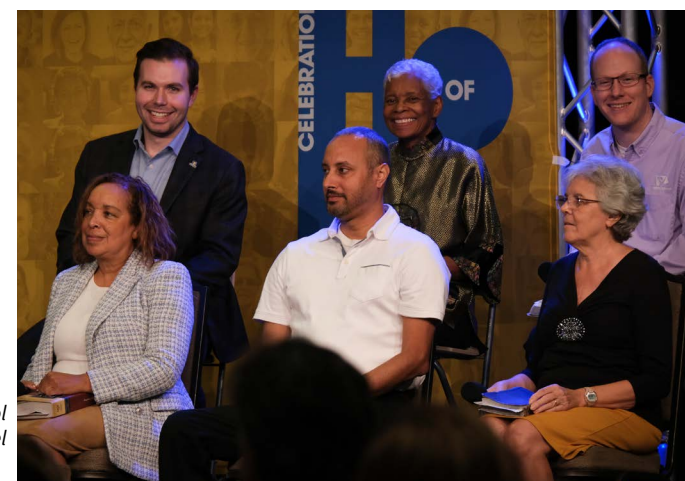
Live study with the Hope Sabbath School panel